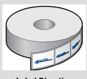
Label Direction Left Side OFF - Outside Peel