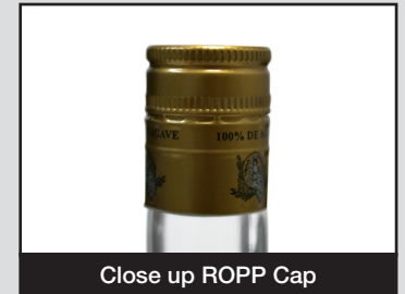
Close up ROPP Cap

2685 S. Melrose Dr. Vista CA 92081 • 760.734.4177 • Fax 760.734.4188 Email: sales@accutekpackaging.com • www.AccutekPackaging.com