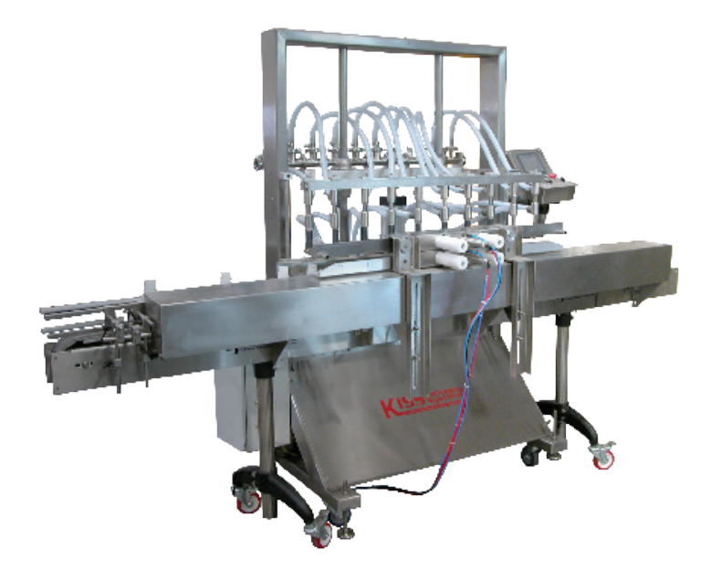
APOF-10 Automatic Ten Head Pressure Overflow Filler